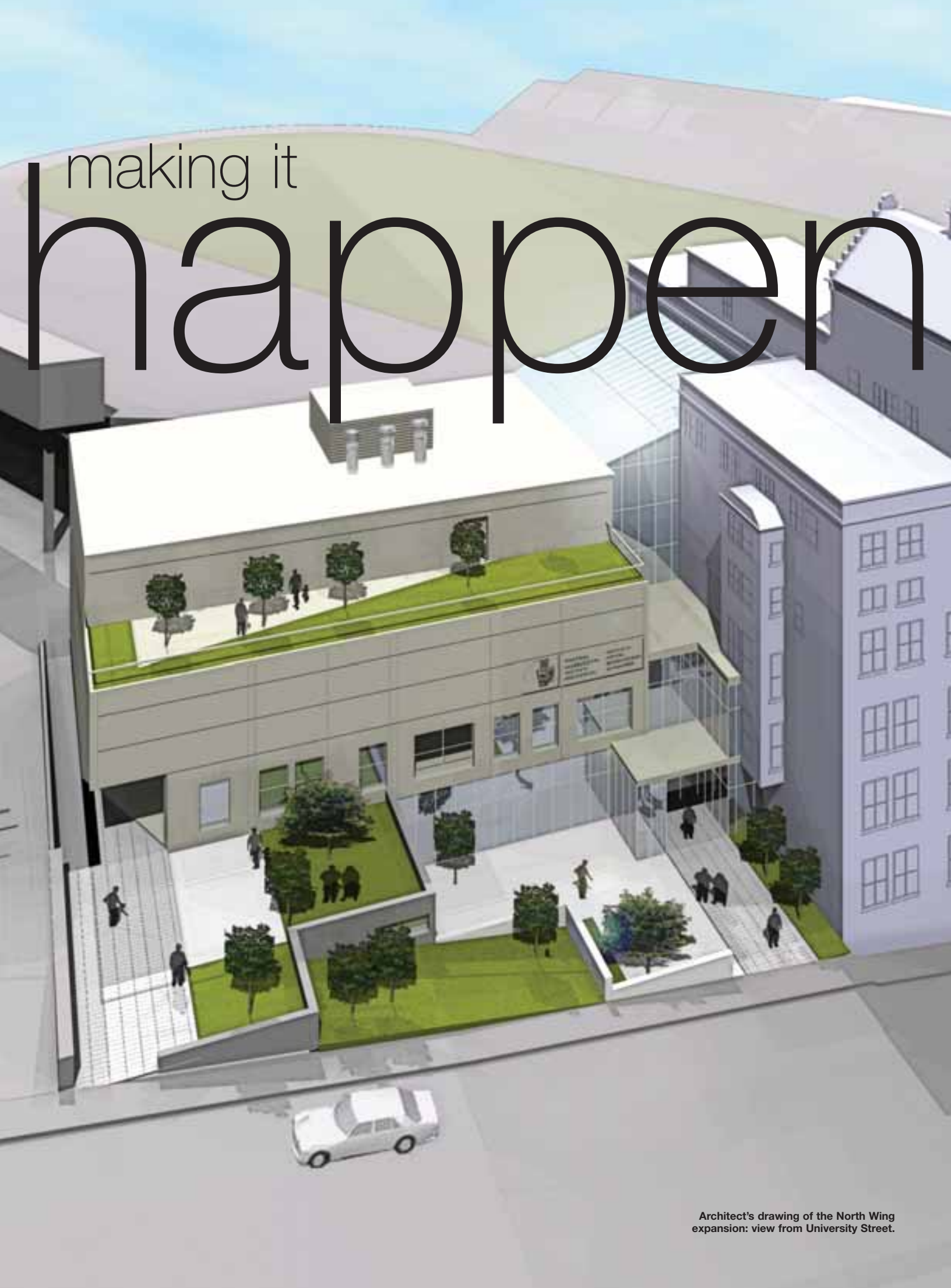
Architect's drawing of the North Wing expansion: view from University Street.